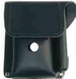
Optional protective leather case for Radalarm II, IV and IV C