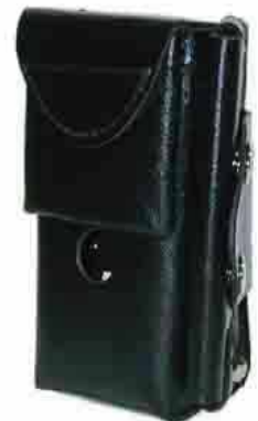
Leather Case included with RFM II