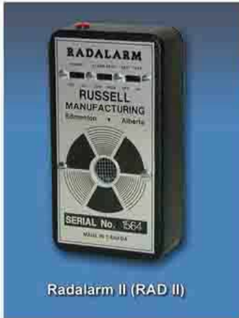
Radalarm II (RAD II)

When it comes to monitoring radiation for your employees and the public, you can't afford to take chances. RUSSELL'S exceptional RADALARM® line of meters and alarms protects personell with HANDS FREE convenience.