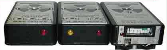
Top view of Meters from Left to Right: RAD II, RAD IV, and RFM II